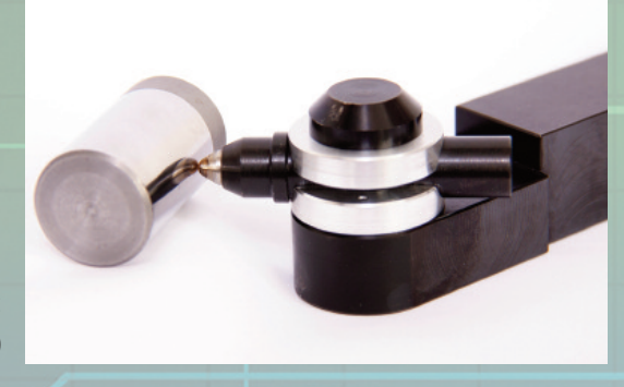
Diamond with radius: 0,8 - 1,2 - 2,0

The tool is available to realise surface roughness in the Ra range between 0,05 and 0,15 micron.